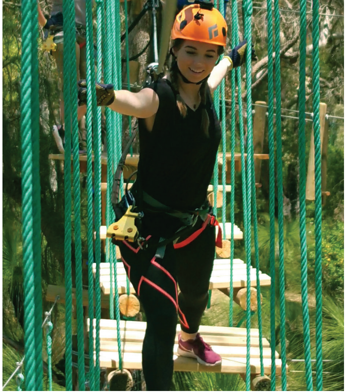
Top: Gloucester Tree. Above: Ropes course.