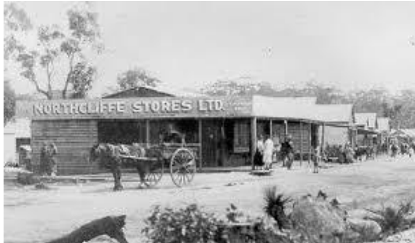
A 1930 photo showing the main street of Northcliffe

The depression of the mid 30's saw the collapse of butter fat prices and this, combined with the banks demanding loan repayments, saw most families leave the area. A few families from each group stayed on and their descendants still farm some of the original land to this day.