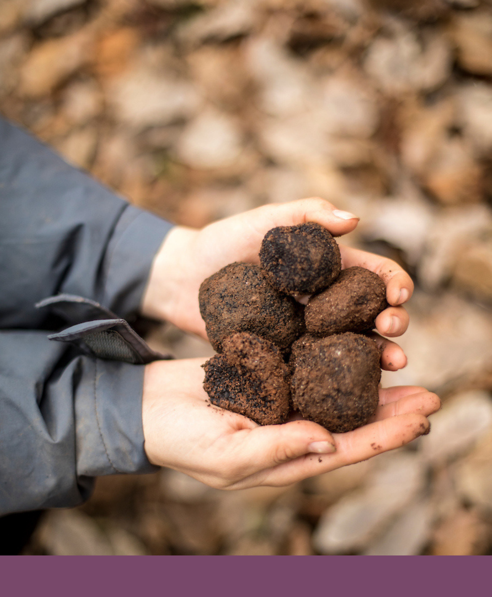
A world away from the every day